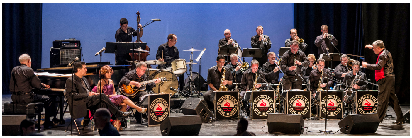
Photo caption: Swingtime Big Band onstage at Heckscher Park, Huntington, for Jazz Week at Huntington Summer Arts Festival

<u>Click here</u> to download a set of high resolution print-ready photos and logos.