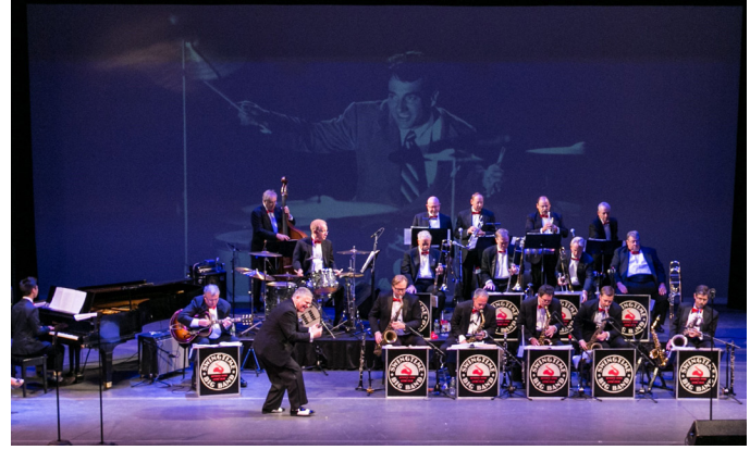
Photo caption: Swingtime Big Band performs under the watchful eye of iconic bandleader Count Basie at The Madison Theatre, Molloy College