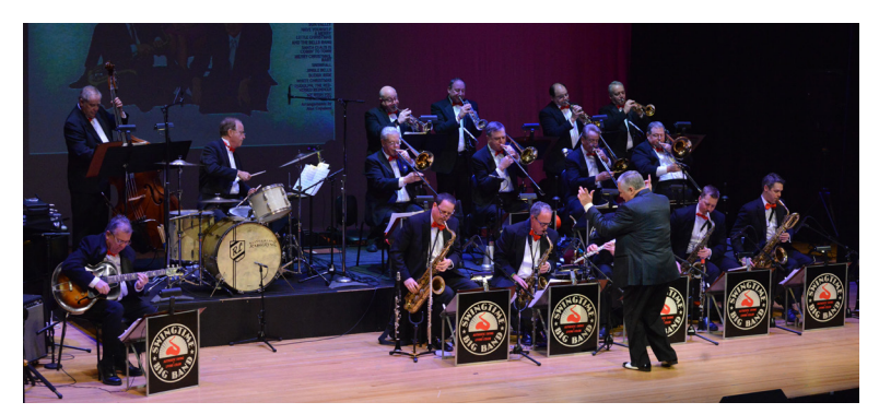
Photo caption: Swingtime Big Band turns up the heat at The Madison Theatre, Molloy College